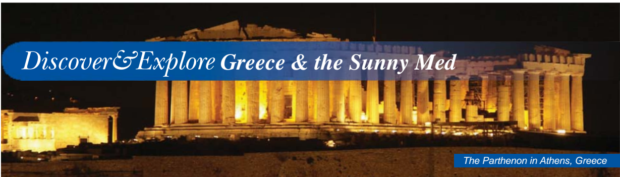
The Parthenon in Athens, Greece